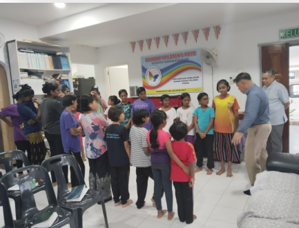
CHILDREN'S HOME, MOSTLY TAMILS WITH MY WIFE & MY DAUGHTER