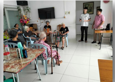
NURSING HOME WITH BRO. E.P. INTERPRETING