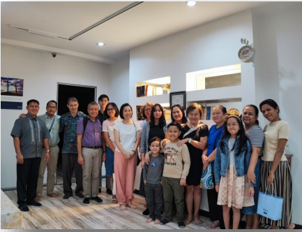
WITH IPOH BELIEVERS

THE WORK OF THE CHURCH IS NOT SURVIVAL. SHE EXISTS TO FULFILL THE GREAT COMMISSION.