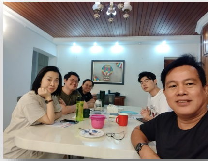
DISCIPLESHIP WITH BRO. E.P.